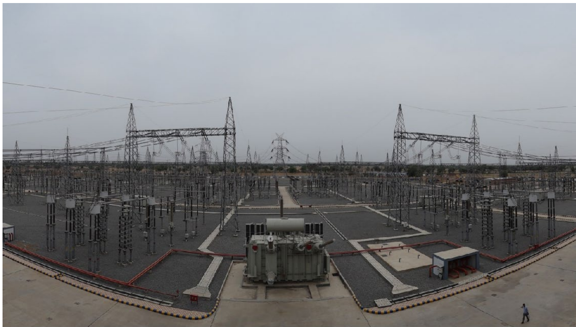
Fig. Mundra HVDC Switchyard

"High Voltage Direct Current (HVDC) is state of art technology that can transfer the bulk power from one place to another place with single hop over long distance. This system offers variety of fine control to change power at will and other stabilising features. The system is also cost effective and acts as a fire wall against cascade disturbances.,