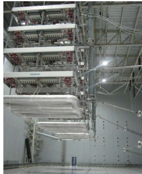
Fig. HVDC Valve Hall