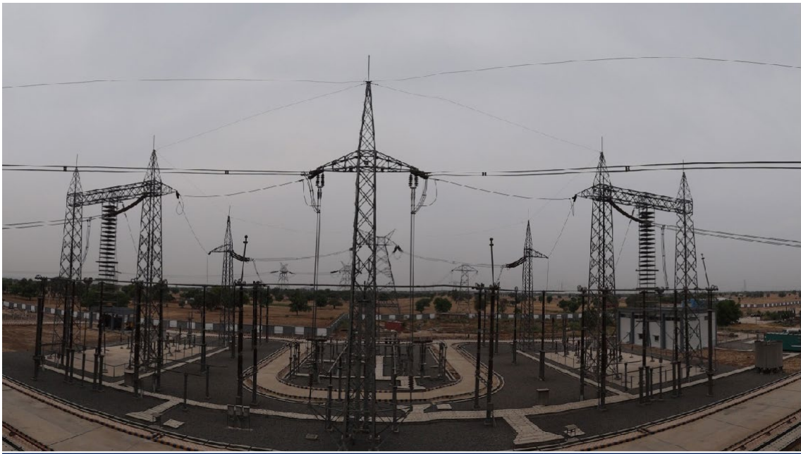
Fig. Mohindergarh HVDC Switchyard