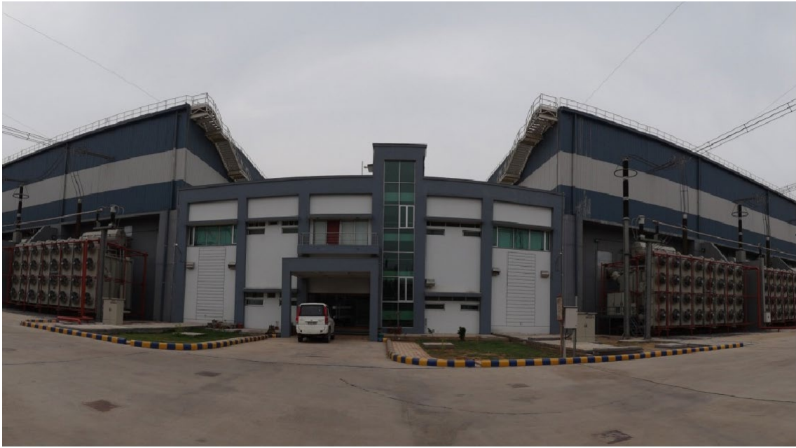
Fig. HVDC Terminal