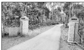
V G Siddhartha’s Chethanahalli estate in Chikkamagaluru.

DARSHAN DEVAIAH B P CHIKKAMAGALURU, AUGUST 1