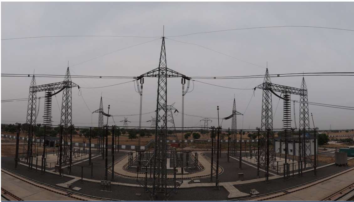
Fig. Mohindergarh HVDC Switchyard