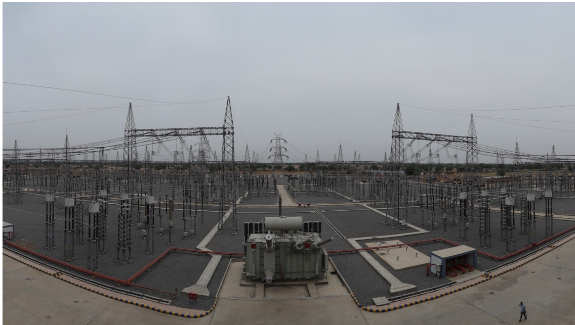
Fig. Mundra HVDC Switchyard

“High Voltage Direct Current (HVDC) is state of art technology that can transfer the bulk power from one place to another place with single hop over long distance. This system offers variety of fine control to change power at will and other stabilising features. The system is also cost effective and acts as a fire wall against cascade disturbances.,